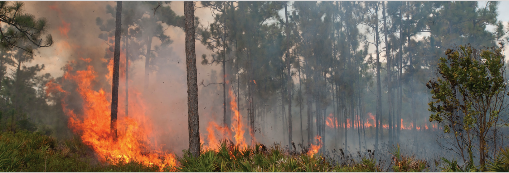
Long-leaf pine savanna on fire

Ever wondered how to ensure your restoration or protection project is successful 10, 20, 50 years from now?