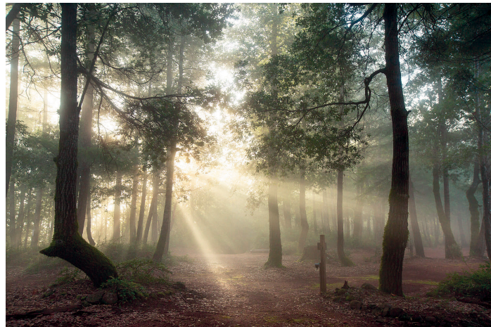
The Rangjung Yeshe Gomde in Leggett California

Directions to the Gomde Retreat Center 66000 Drive Thru Tree Rd, Leggett, CA 95585