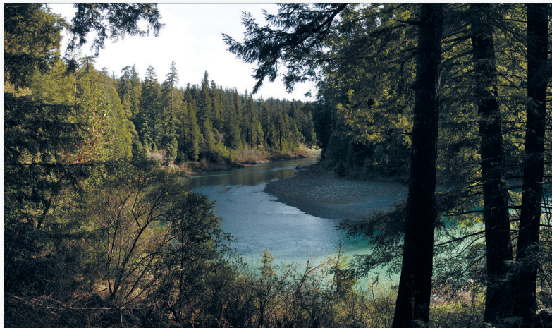
South Fork Eel River By Pernel S. Thyseldew