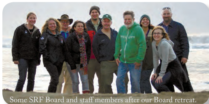
Some SRF Board and staff members after our Board retreat.