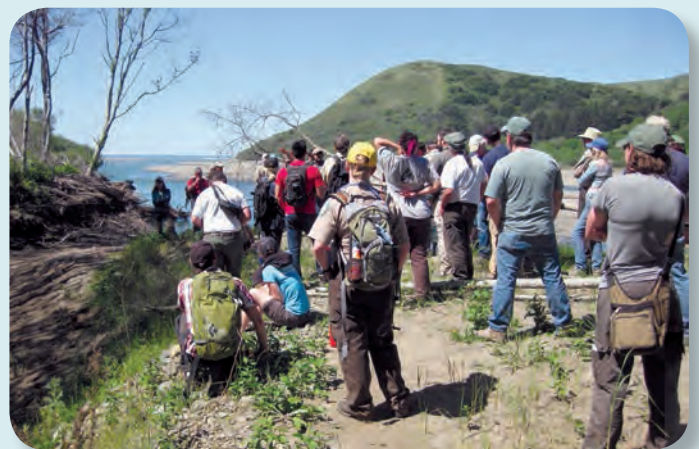
Confab participants will have an opportunity to explore new restoration projects at the Mattole estuary, the westernmost point of the continental United States.

SRF, in cooperation with the CA Department of Fish and Wildlife, Mattole Restoration Council, Mattole Salmon Group, and Sanctuary Forest, will offer workshops and tours of off-channel slough restoration, forest and fuels reduction projects, water conservation practices, stream bank stabilization, large woody debris, and a tour of groundwater recharge planning projects. The Confab will specifically include a tour of Mattole estuary off-channel slough excavations, riparian restoration, Heliwood procurement, placement, designs, logistics, monitoring, and pool creation results. This year, we are also excited to feature a Prosper Ridge meadow reclamation and fuels reduction tour on BLM property and private land meadow reclamation and forest edge treatments. Additionally, we will explore water conservation projects in the Mattole headwaters and innovative groundwater recharge planning projects.