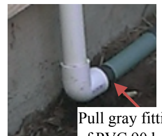
Pull gray fitting out of PVC 90 here to flush the system

Open any partially closed ball valves, and make sure the end of each line is open. Attach a garden hose to the clean out point and blast system with water to flush any particles in the system. Any time you attach a garden hose to temporarily flush the system, make sure you have an anti-siphon valve or vacuum breaker on your garden hose-bib, this is a code requirement.